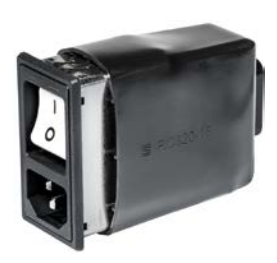
RC320 Rear Cover for Power Entry Module